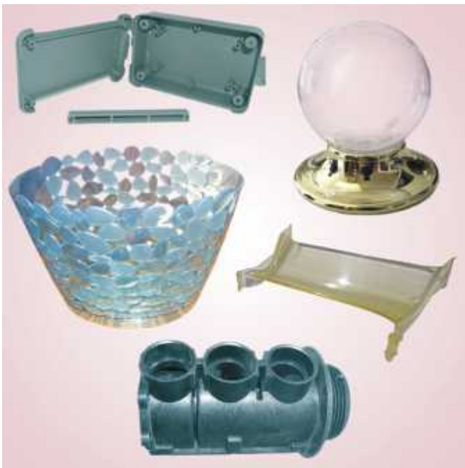
Products Manufactured by Sare Plastics

Sare Plastics Will Reduce Your Tooling and Production Costs