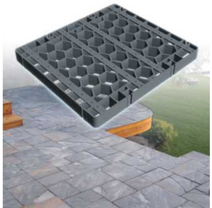
Silca System® from Sare Plastics www.silcasystem.com